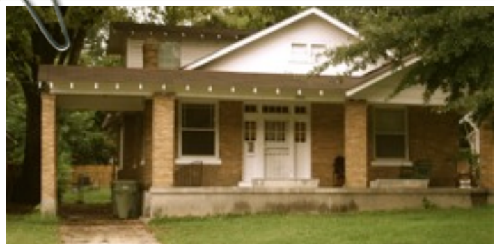
The Hebron Guesthouse