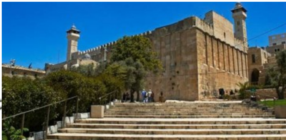
The Cave of the Patriarchs

The “Hebron House” offers an alternative. While living and working in the inner city of Memphis, you will have an opportunity to live as faithful disciples of Jesus Christ, using the gifts that God has given to you to love and serve the poor. You will also have the opportunity to gain a vision for making disciples of all nations while being empowered to do so. Our hope is that the Hebron House will serve as a staging area in your own personal spiritual journey, preparing you to face the spiritual giants of our world through faithful obedience to Jesus.